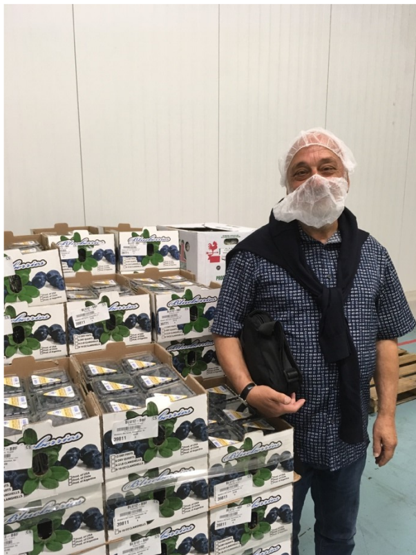
The author in the fruit chiller, Common Market, Philadelphia

low margins this enables them to keep their mark up low. Besides, in some states and product areas where competition is tough, farmers might choose another distributor if mark ups were higher.