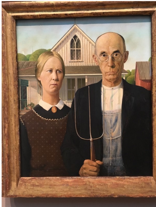
Source: Art Institute of Chicago American Gothic by Grant Wood (1930)

In Italy, where the prevalent and well established form of producer cooperatives collaborate with consumer cooperatives to market a large percentage of a wide variety of foodstuffs such as tomatoes and cheese, new initiatives have arisen alongside these to bring good food closer to the urban centres. In both countries, we are witnessing the growth of new infrastructure that enables small producers to operate in markets formerly dominated by large farms. And at the same time, there is a growing awareness of the need for a systems approach to tilting the food and catering industries in a more sustainable direction.