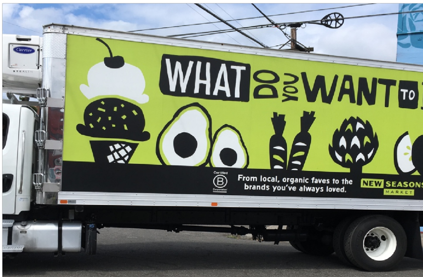
Delivery truck departing the Redd

Small and medium size farms struggle to find a toehold in the market. Alone, they often lack the expertise to meet consumers' precise requirements and mandated quality standards. They are driven to sell at farmers markets which typically provide low returns for heavy outlays of labour. A gap analysis carried out by Ecotrust, a charity that exists to promote sustainability, highlighted the difficulties producers had in reaching out to institutional consumers, a market with potentially the biggest returns. It also showed the potential for increasing awareness about food. As a result, Ecotrust decided to find investment for two projects: an events space for the trust and its partners, and an incubator food hub, the Redd. 20 Through the Redd, as business manager, Kaitlin Rich explained, rural producers can make one efficient drop rather than dozens all over town, entrepreneurs can access scale-appropriate services and office space, and direct-to-consumer farmers, ranchers, and fishermen can pack and distribute their CSA (community supported agriculture) and CSF (collaborative farm share – multiple farm CSA) orders with ease. The idea is that shared space promotes shared ideas and projects. Currently, 170 food businesses utilize the services provided by this dynamic facility. The Redd is aimed at start ups but not exclusively. There is a special focus on business start ups by people of colour.