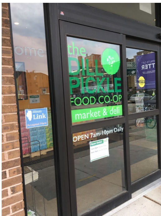
Dill Pickle food coop, Chicago

Ally Young began working in a coop store doing 2 hour shifts in return for 15% discount. Now she is employed as community relations manager for Dill Pickle, a new store built with $1m. of loans from coop members plus local grants. Now running at $6m. turnover. The store provides basics at low cost, subsidised by sales of other goods but the profit margin is close to zero partly because they insist of paying well with benefits so most employees are full time.