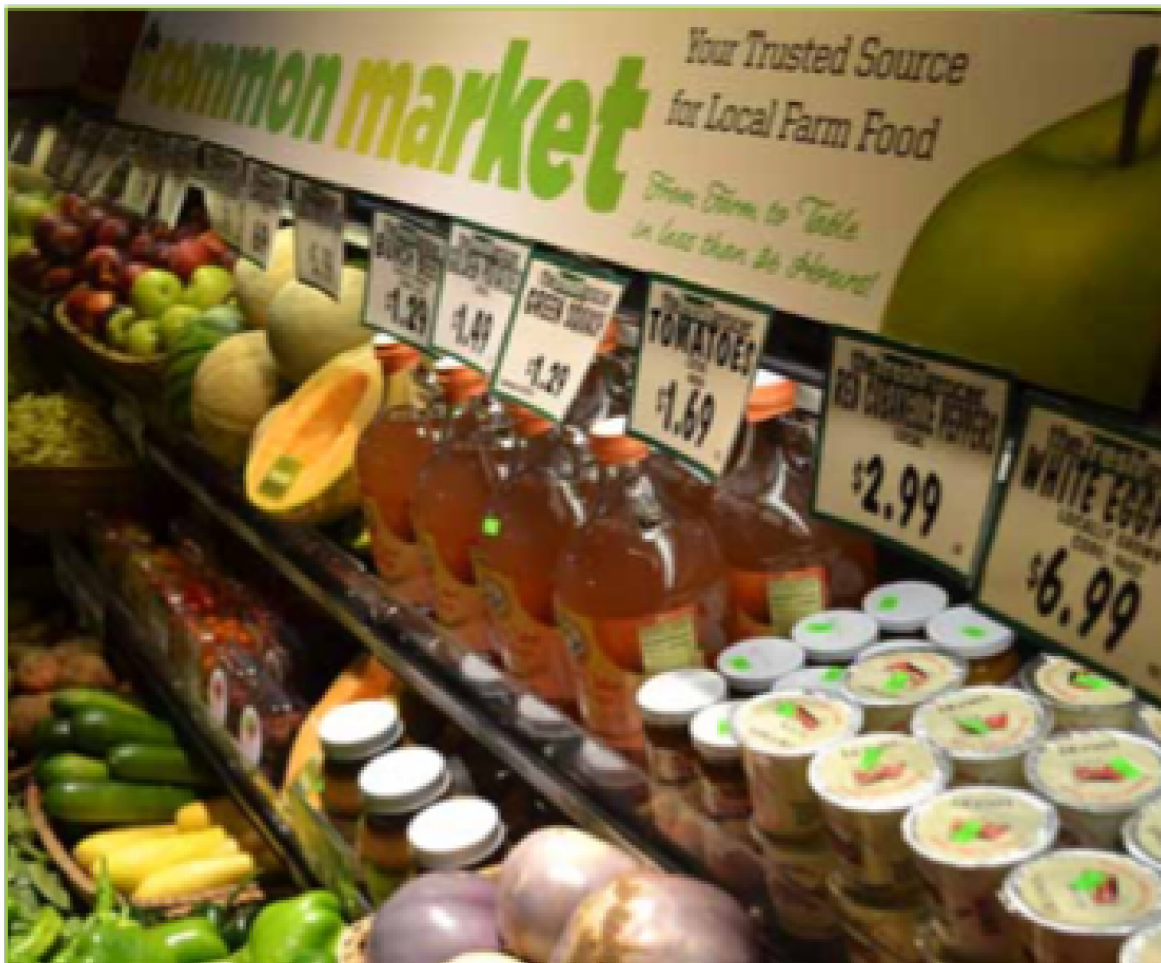
Display of some of Common Market's range of fresh and processed foods

This is part of a five year expansion plan designed to lever the expertise and infrastructure developed in Philadelphia. Its customers include colleges and universities, hospitals, company cafeterias, schools, care homes, nurseries, restaurants and retailers. They put a lot of effort into working with tricky (or picky?) customers such as hospitals. Getting it right shows what can be done. Lankenau Medical Center have invested in using diet to improve health outcomes and created a cafeteria that has become a popular local community lunch venue in its own right.