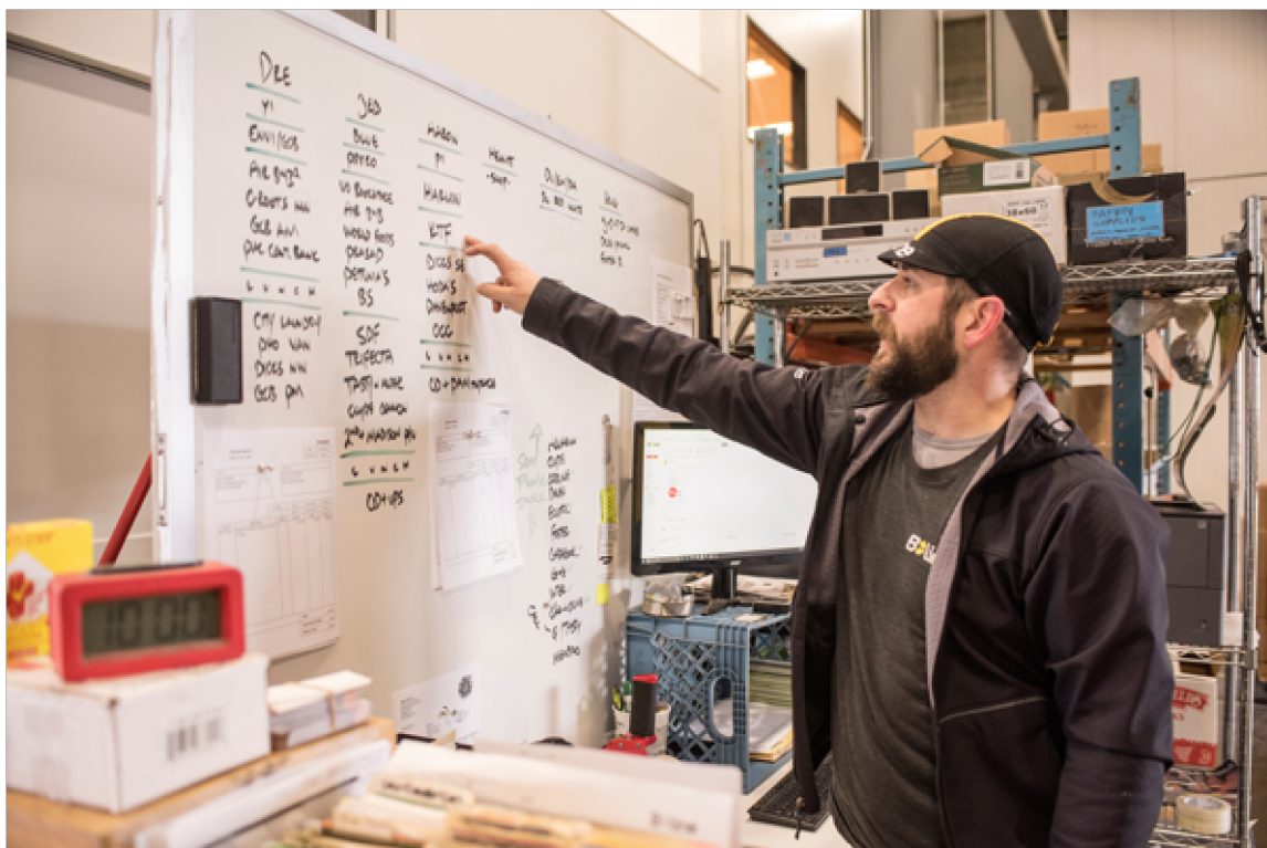
Organising deliveries at The Redd

A key feature of the Redd is its focused support for nine of Ecotrust’s Ag of the Middle Accelerator participants — regional farmers, ranchers and fishers who are leveraging warehousing, networking and business support services at the Redd to expand their Portland-area sales. Agriculture of the Middle is a programme aimed at expanding the turnover of small and medium producers that are larger than those selling via farmers markets or CSA but smaller than those supplying globalized commodity markets and who want to sell locally.